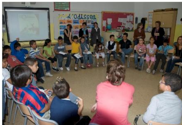
Dialogic literary gathering. 3 rd Year classroom reading The Odyssey