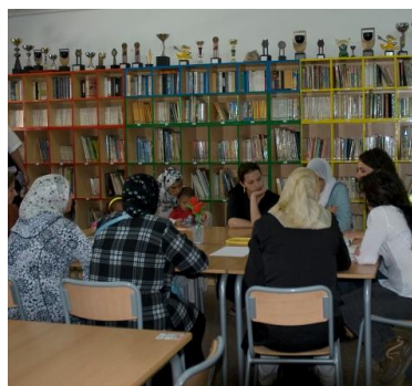
Dialogic literary gatherings. Immigrant mothers reading Romeo and Juliette

Dialogic literary gatherings are aimed at adults who do not have a university-level education. At these sessions, people share the reading of classic works of literature, from writers such as Kafka, Joyce, Dostoyevsky, García Lorca, and Cervantes. Through engaging in dialogue about the literature, participants deepen their understanding of language and engage in debates based on their own life experience. It is ultimately a very empowering experience. Gatherings are organized in schools with mothers, fathers, and other members of the community. Anyone interested can attend; it constitutes a way not simply to learn, but also to open the school to the community.